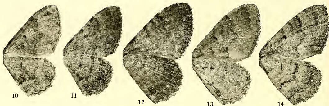
Figs 10-14. Vesiana spp., wings underneath. 10. V. tamborica , male, Tambora, Sumbawa. 11. V. inimica , male, Bali, Mondoktoempang. 12. V. hollowayi , spec. nov., male, Borneo, Mt. Kinabalu. 13. V. robinsoni , male, Sumatra, Sungeikumbang. 14. V. sordidata , male, India, Darjeeling.